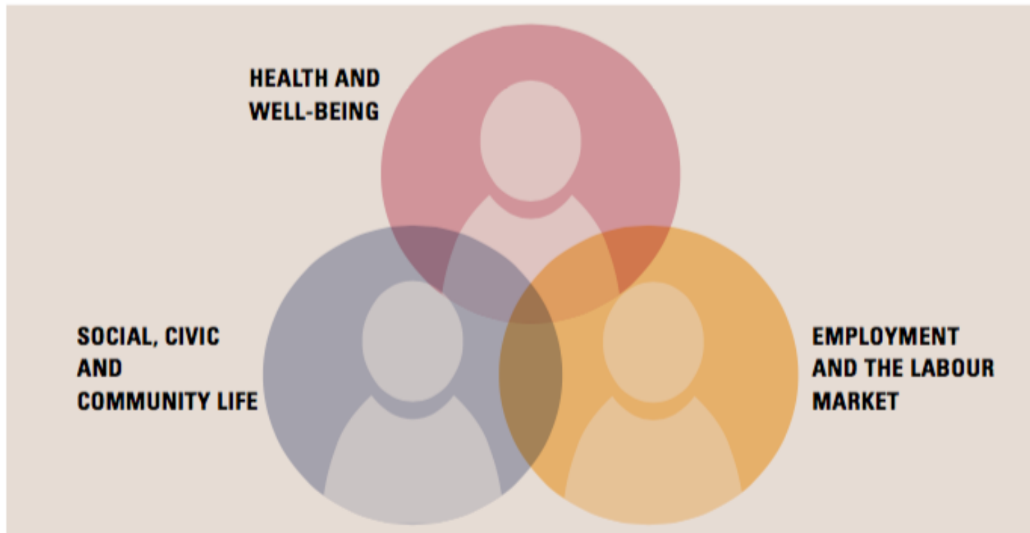
Figure 0.1 The overlapping benefits of ALE