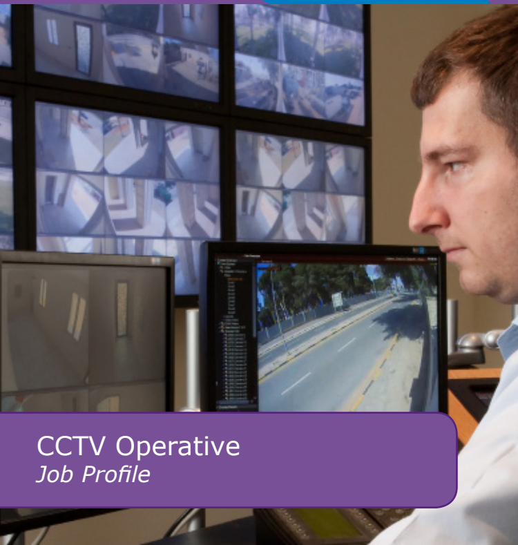
CCTV Operative Job Profile

Skills for Security Kirkham House John Comyn Drive Worcester WR3 7NS